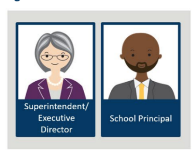
Figure 3: Staff Who Have Roles for Testing